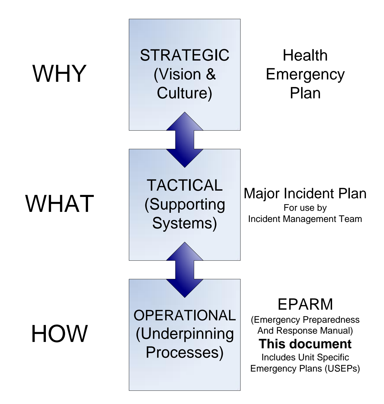
Figure 1: The relationship between Auckland DHB plans and their management levels