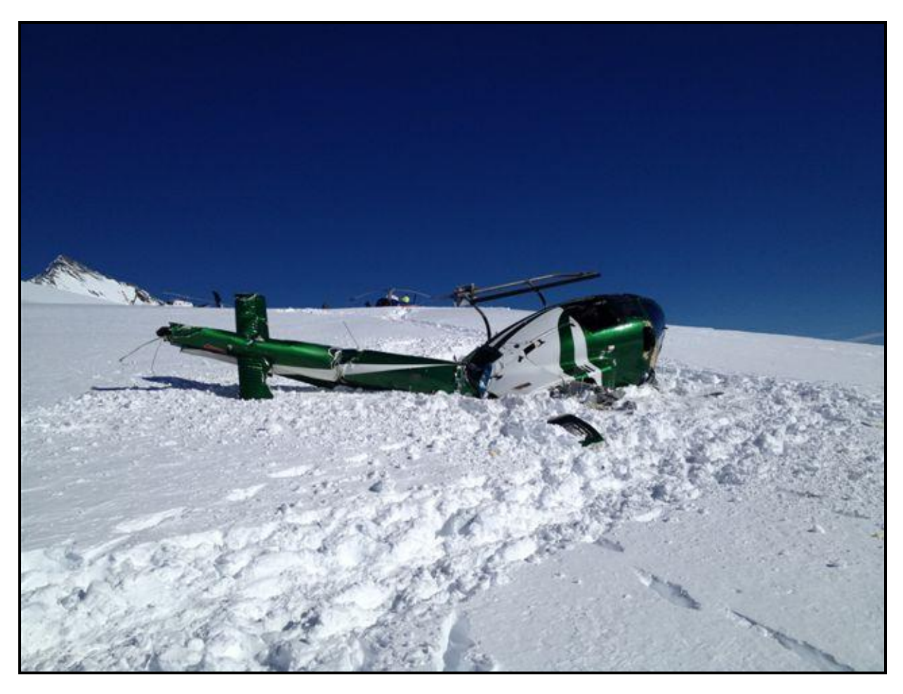
The accident scene, with ZK-IMJ in the foreground and ZK-HAE in the background