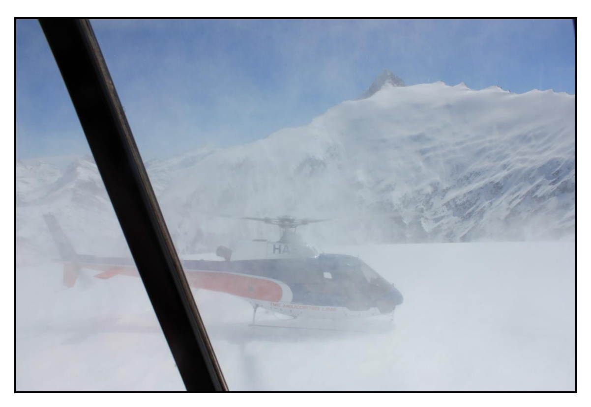
Figure 1 The parked helicopter as seen on the go-around from first approach

3.1.9. The helicopter continued to move towards the parked helicopter until its lower vertical stabiliser and tail rotor hit the main rotor blades of the parked helicopter. The tail rotor assembly and vertical fin separated from the helicopter and fell in front of and to the right of the parked helicopter.