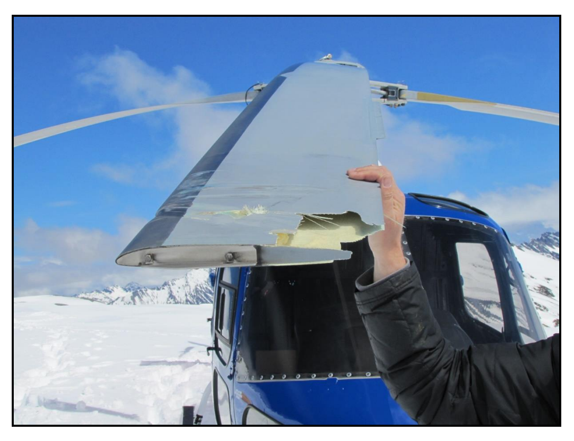
Figure 3 Typical damage to the main rotor blades of the parked helicopter