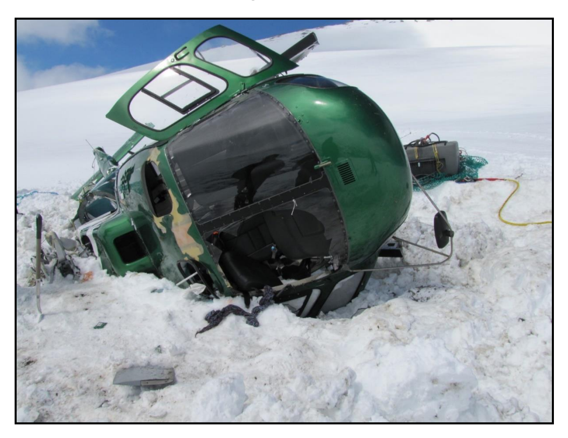
Figure 2 The helicopter after the accident (with de-fuelling kit alongside)

3.3.1. The helicopter came to rest on its right side (see Figure 2). The main rotor blades were attached but had shattered from striking the snow while under power. The tail assembly had fallen about 15 m in front of and to the right of the parked helicopter. The severed lower vertical stabiliser was located, but the removed section of tail rotor blade was not found. The front-left cabin door was detached in the ground impact.