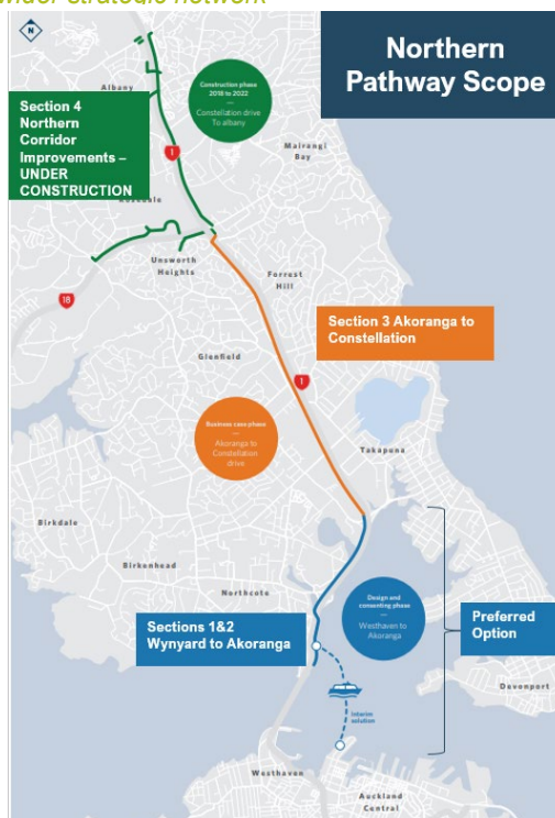
Figure 2 Integration of Northern Pathway with wider strategic network

There is a significant additional unlocking opportunity with the inclusion of the Northern Pathway Section 3. Akoranga to Constellation is already highlighted as a key priority in the Auckland RLTP (refer to Figure 2). This is section is not currently within the scope of the 'new' Northern Pathway identified by the Joint Ministers and would need to be presented as recommended additional scope.