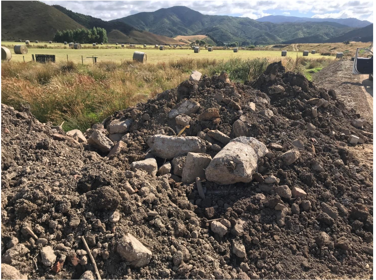
Figure 6. Stockpiles.