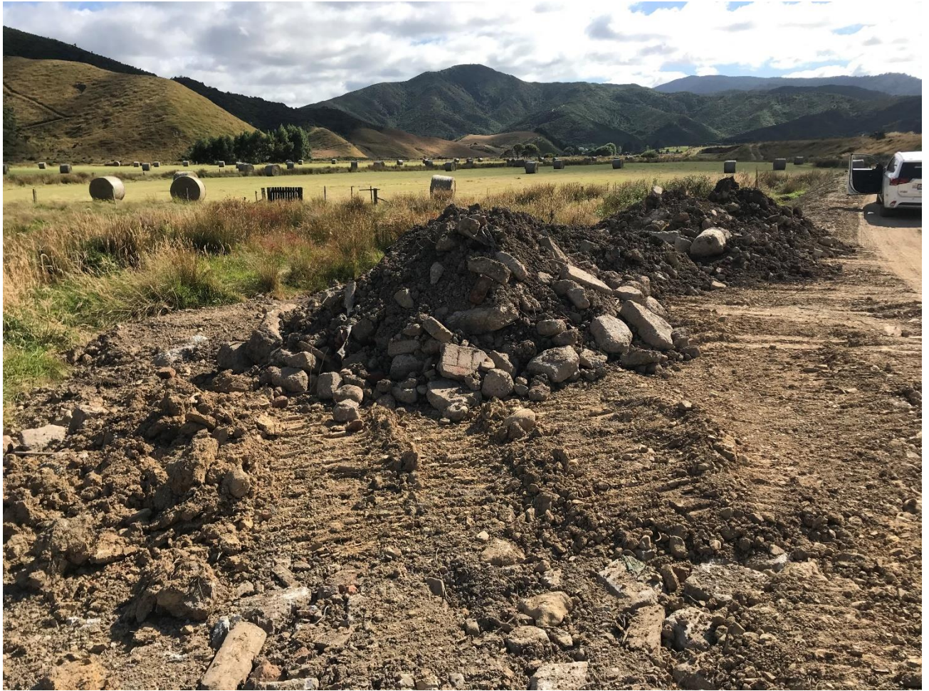
Figure 5. Stockpiles