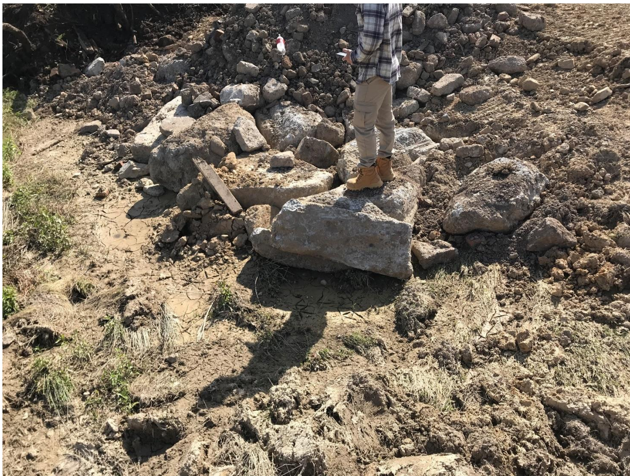
Figure 4. Stockpiles

There were approximately half a dozen stockpiles of material on the platform. Soil, concrete, brick, rebar, and a tire were observed.