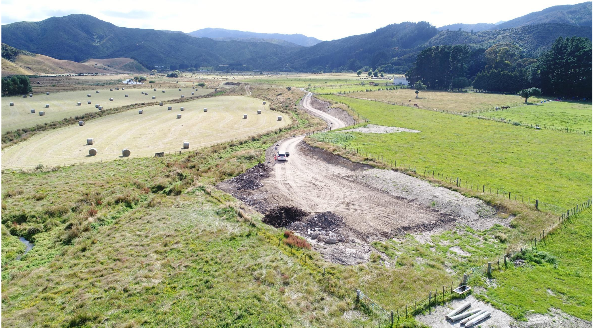
Figure 3. Platform and farm road/haul road.