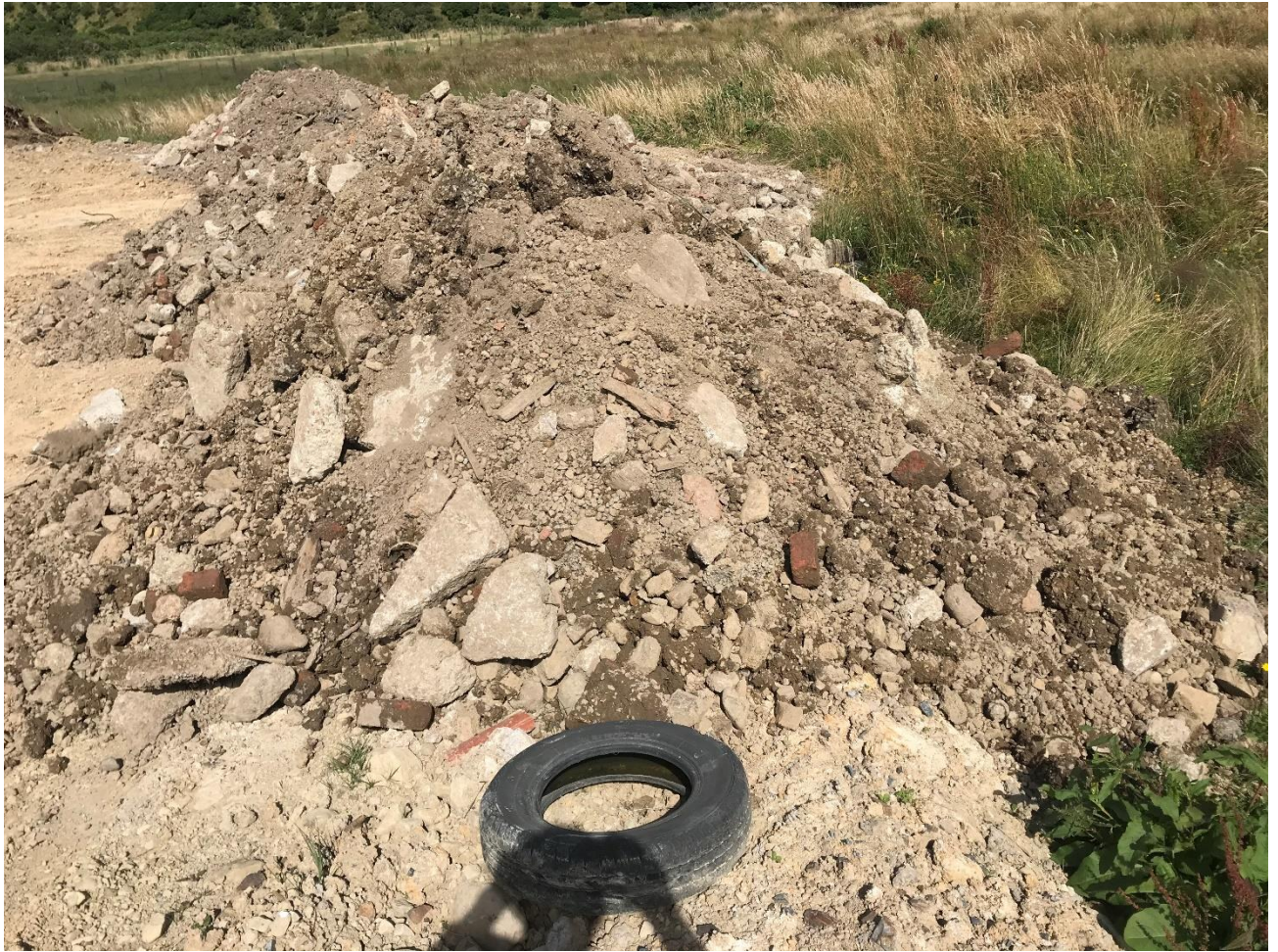
Figure 7. Stockpiles.