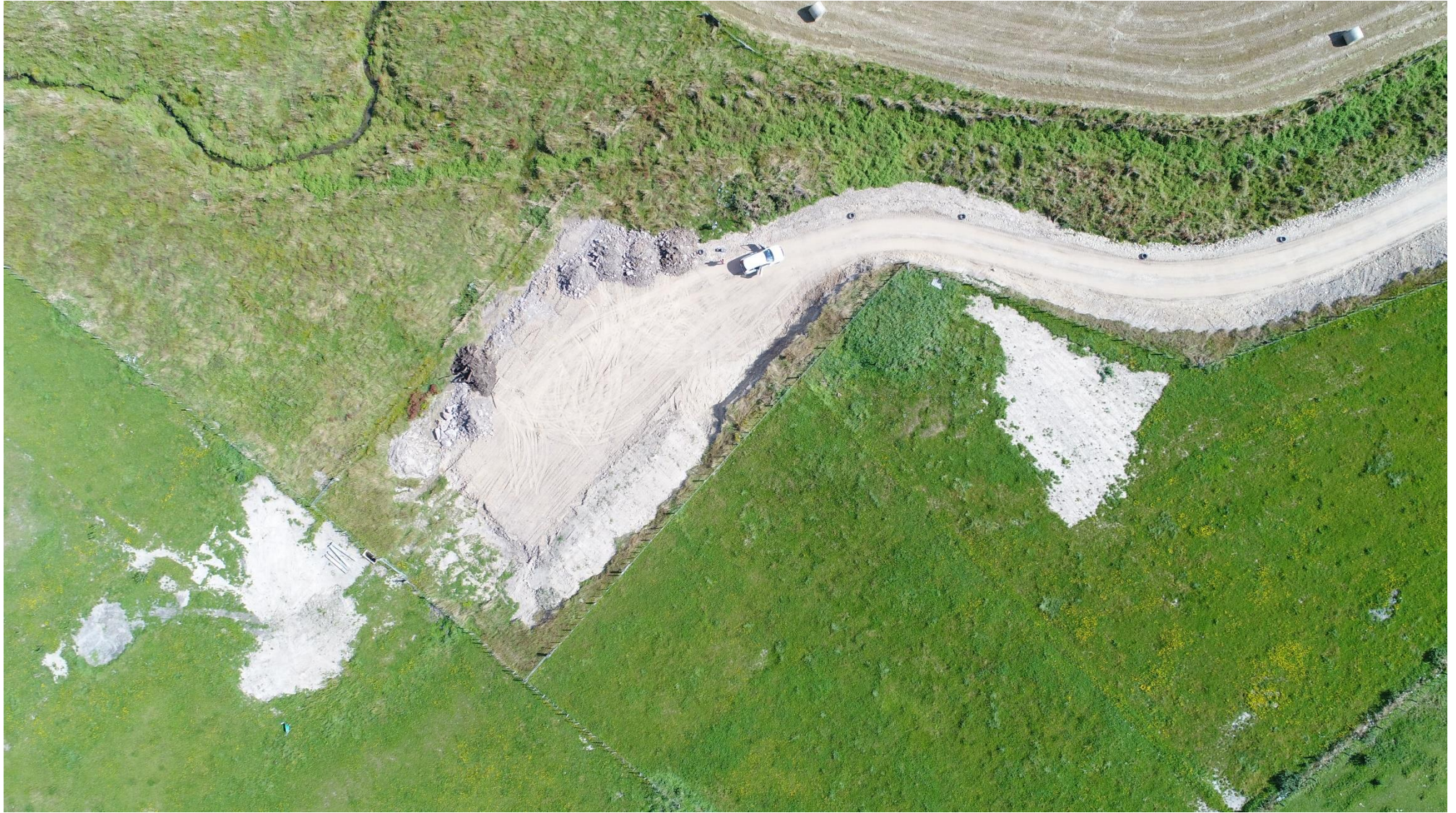
Figure 2. Platform and stream.