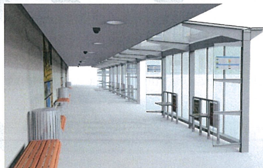
CNC LVL Neighbourhood Interchange