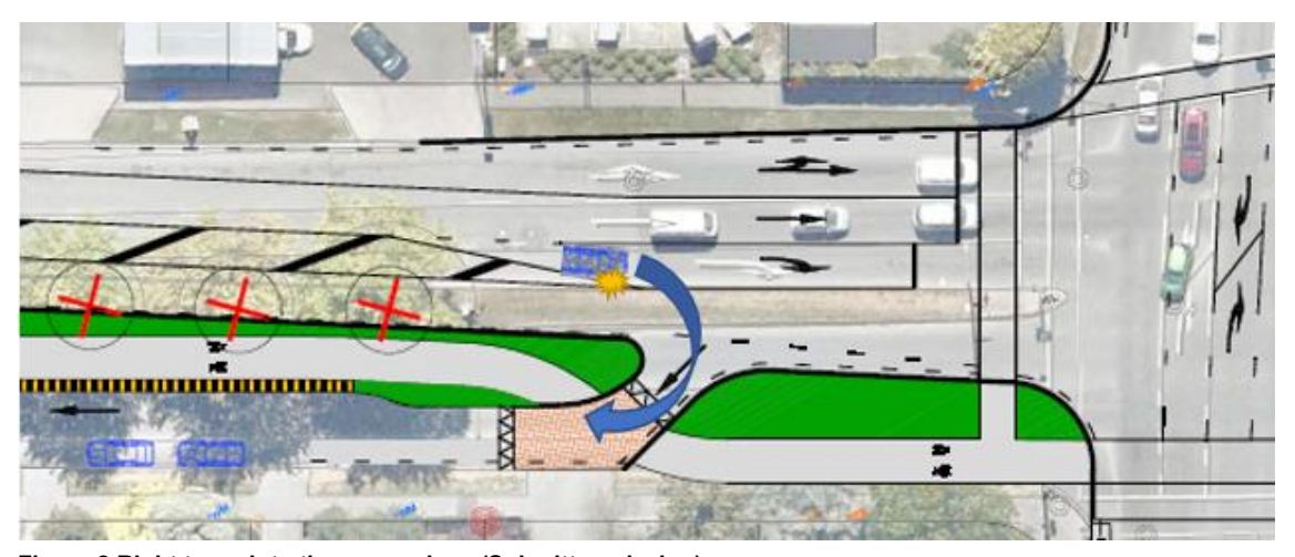
Figure 2 Right turns into the access lane (Submitters design)

We consider that moving all through traffic to the north side of the central median, as proposed in the Submitter's design, is fundamentally unsafe for all road users and will make living on the north side less pleasant.